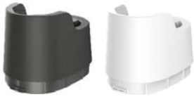
General Purpose (Black) Battery Cup