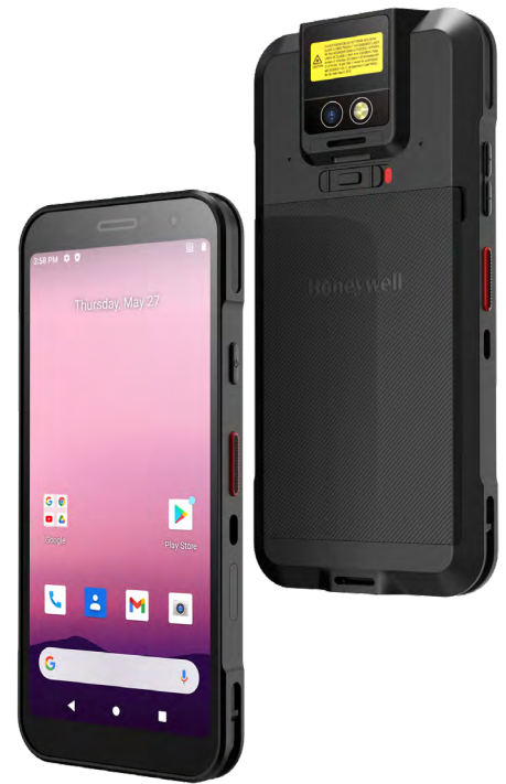
The CT32: 5G mobile computer on the Mobility Edge™ platform, 5G + Wi-Fi 6E, S0703 or S0803 scan engine, stylish, durable, and long lifecycle

The CT32 comes with an extensive range of accessories, including booted and non-booted Universal Dock chargers that can be upgraded in the field by the end user without requiring tools. This ensures compatibility with multiple Honeywell field mobility computers both now and in the future. Additional accessories include booted and non-booted home bases, booted and non-booted quad charging bases, a scan handle, an RFID reader handle designed for efficient cycle counting, a TPU boot, a battery and quad battery charger, as well as a hand strap, wrist strap, and headset.