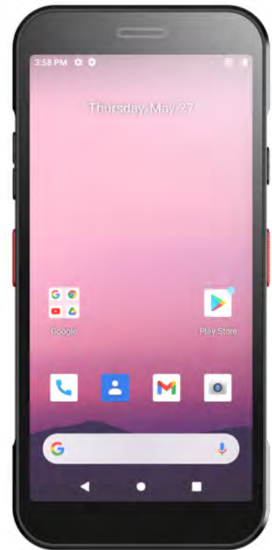
The CT32: 5G mobile computer on the Mobility Edge™ platform, 5G + Wi-Fi 6E, S0703 or S0803 scan engine, stylish, durable, and long lifecycle

The cloud-based Operational Intelligence solution goes beyond traditional MDM tools by analyzing data and converting it into actionable insights. It helps simplify lifecycle management of mobile assets, increase productivity, and lower costs.